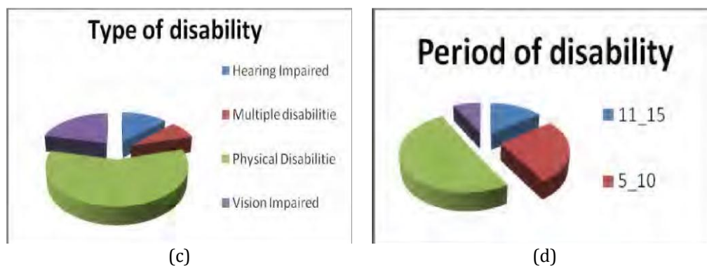
Figure 2. result of biographical information (c) What type is your disability (d) Responses according to how long they have been in the disability.

Figure 2 (c) shows a high proportion of this increase is in physical disability in males, Figure 2 (d) shows the number of disabled people in the city dramatically in the last three years. This rise due to the war